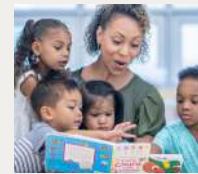
5 Lead Teachers