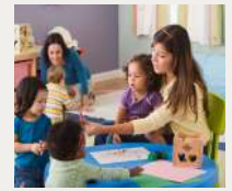
4 Assistant Teachers

...where parents pay an average of $10,000 per child annually.