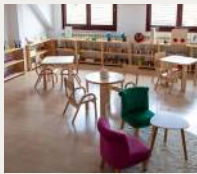
Open 10 Hours/Day